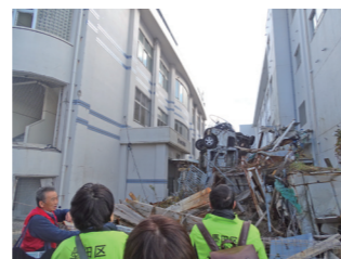
Survey of affected area

Sumida City has established the Sumida City Disaster Prevention Specialist Network Council, which consists of residents qualified as disaster prevention specialists, to secure experts who can carry out disaster preparedness measures. During normal times, the council conducts research and training related to disaster preparedness and cooperates with local disaster preparedness activities and the like. During times of disaster, the council strengthens disaster response capabilities by carrying out lifesaving and emergency rescue activities, confirming the safety of residents with special needs, and providing evacuation guidance.